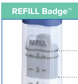
REFILL Badge ™

Screw-on cap after each dose to prevent evaporation. Be sure cap is secured completely.