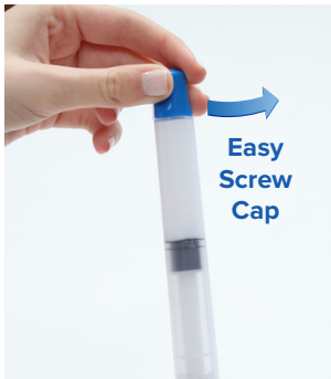
Easy Screw Cap