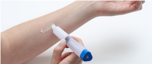
Targeted Transdermal MICRO-Dosing